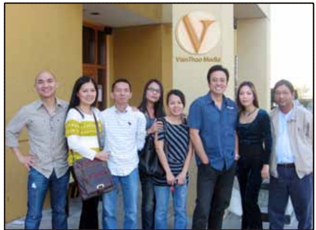
Vien Thao Media's staffs