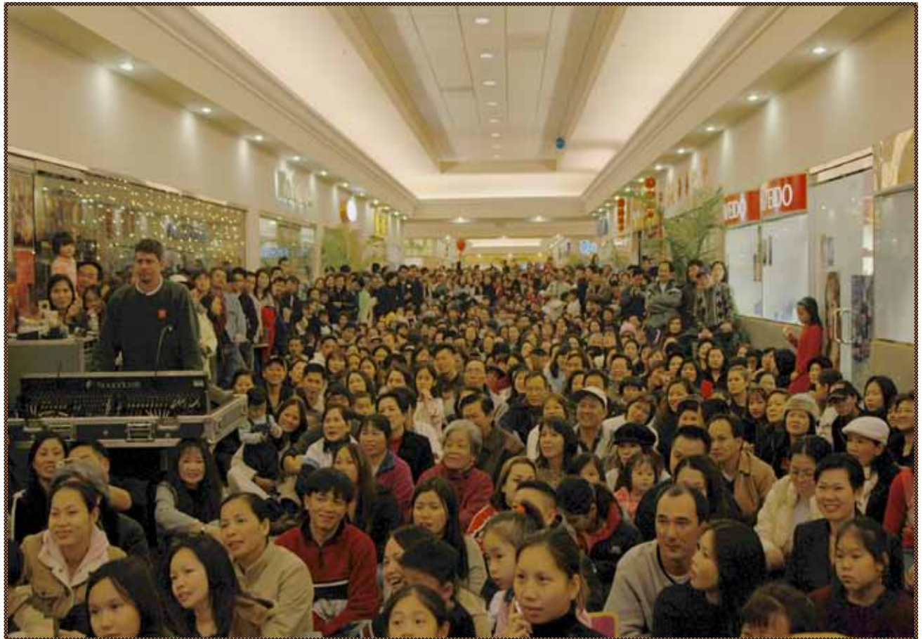
Audiences attending Tsunami concert organized by Vien Thao Media